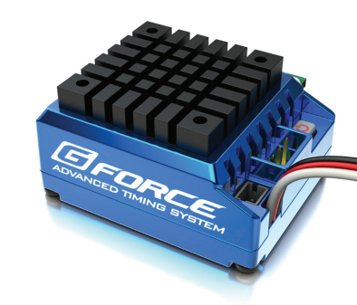
[G FORCE TS120 COMPETITION]